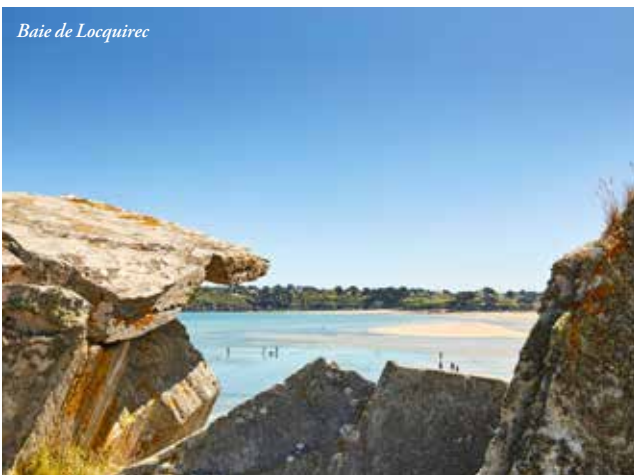
Baie de Locquirec

Follow us and tell us all about your visit, share your memories and photos on our social media platforms using #baiedemorlaix