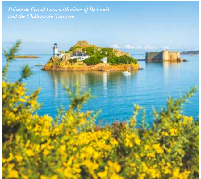
Pointe de Pen al Lan, with views of Île Louët and the Château du Taureau

the former girls' school. Here, you can find out about diving, sailing, accommodation, walks and events. •